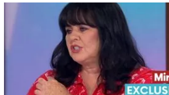
Coleen Nolan 'asked' to share cancer diagnosis on Loose Women for one reason