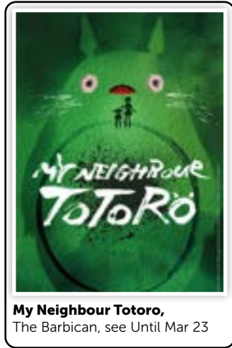
My Neighbour Totoro, The Barbican, see Until Mar 23

Kid Carpet wants to win the Garden contest. The Noisy Animals really want to run a garden centre. Nothing could possibly go wrong. With catchy songs and puppetry. 11am, 2pm, 3-8 . artsdepot, N12 OGA. From £12 www.artsdepot.co.uk