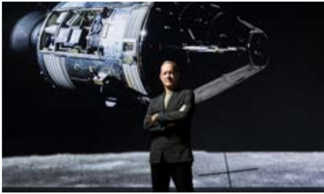
The Moonwalkers: A Journey with Tom Hanks , Lightroom. See Events, Until April 21

Sundays Junior Park Run 2km Fun family runs. Enfield Town Park, EN2 6TJ, Lordship Rec Ground, N17 6BQ, Priory Park N8 8LN, Caledonian Park N7, Highbury Fields N5, Friary Park N12 9PQ, London Fields, E8 3EU, Leyton Jubilee Park, E10 7BL, 9am. 4-14 . Free, register. www.parkrun.org.uk