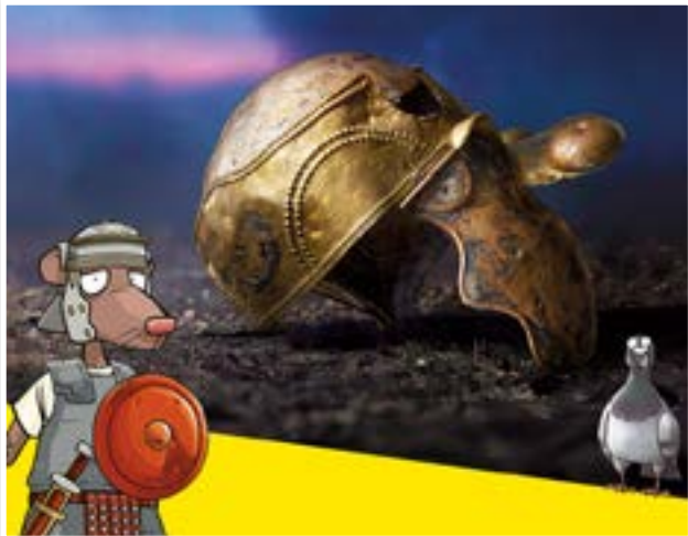
Legion: Life in the Roman Army , Horrible Histories trail with Rattus British Museum. See Feb 1. See Mar 9 for Roman-themed sleepover.